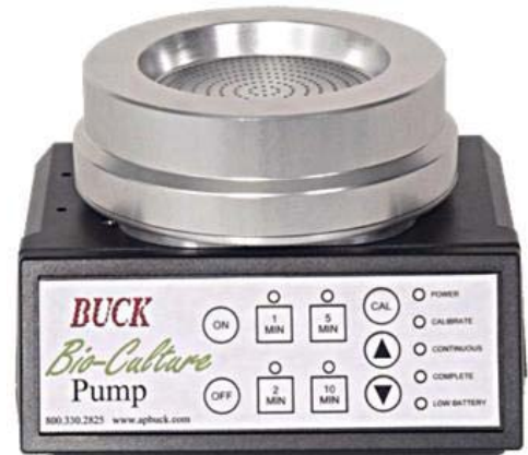
Model B30120 30-120 LPM Programmed Sampling for Bio-contaminants Sampling

The front key pad is organized into three functional key groups: Power (ON-OFF), Timing (1, 2, 5, 10 minute samples), and Calibration (Cal mode, Increase flow, Decrease flow). Positive tactile feedback is provided by the keys. The BUCK Bio-Culture™ Pump has internal NiCad batteries to provide a full six hours continuous run time at 100LPM. The standard smart charger provides a battery recharge in 2.5 –3 hours and allows the unit to operate on AC power. End of sample notice is provided by the lit LED “Complete” and three short beeps.