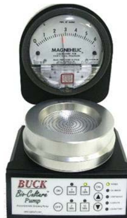
Calibration Head Attached to Pump

*Depends on battery maintenance, backpressure, etc.